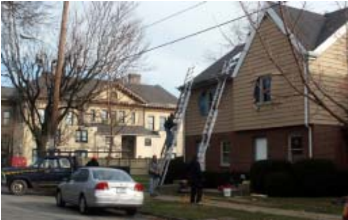
New roofs, new siding, new windows, new interiors and sidewalk and parking lot repair are combining to make these affordable Housing units the showplace of the Community Properties of Ohio (CPO) portfolio. Management wants them to blend seamlessly with Harrison West.