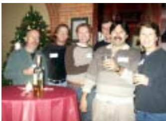
All the eating and talking at the Holiday Potluck every December.