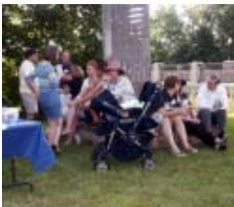
All the eating and talking at the Summer Party in the Park every July.

Lots More Fun and Tasty Reasons to Join the Harrison West Society