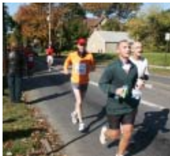
Lots of fun and exercise at the Marathon Party every October.