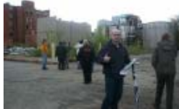
The very damp Park Committee got right to inspecting the site.