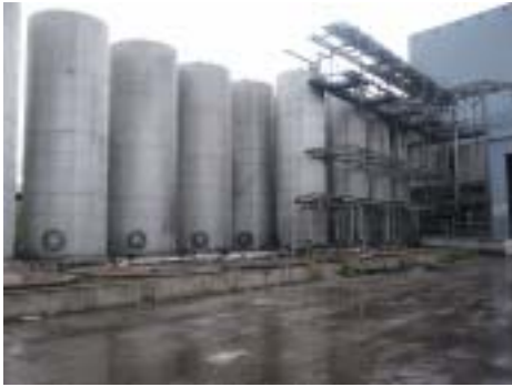
The honey locust Grove will be here. Imagine the serenity of the stately Grove, with delicate leaves fluttering in the breeze.