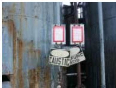
The caustic pools and sulfuric acid in rusty tanks soon will be gone, replaced by flower beds, picnic tables, and a Community Center.