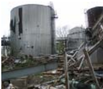
Try to imagine the Harrison Park Pavilion here.

It took imagination to see the vision. See Pages 4 and 5 for more pre-park pictures.