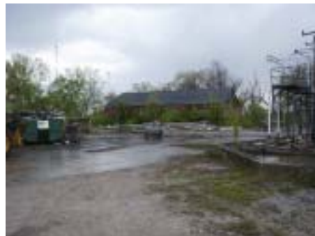
The picture on the left shows the south edge of the park. The picture on the right shows the north edge of the park - Second Avenue is beyond the buildings.