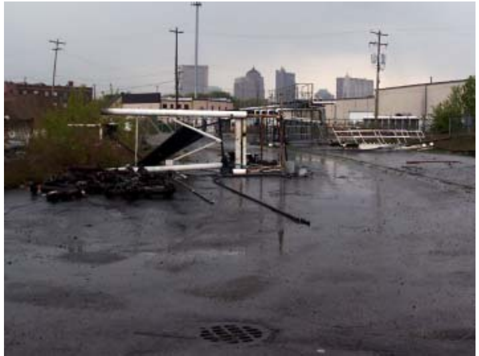
The view of the downtown skyline will be lovely. The Park Committee already is planning the Harrison West Red, White, and Boom party.