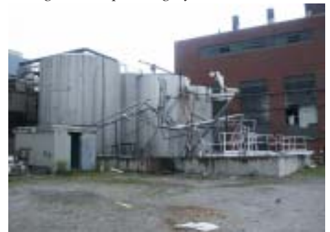
Dump and depressing, the plethora of tanks, pipes, decrepit buildings, junk, trash, broken glass, and general ugliness (above and below) could not dampen the enthusiasm and the vision of the Park Committee.