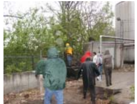
The River Overlook behind the Pavilion caught the attention of everyone, even though it was pouring by then.