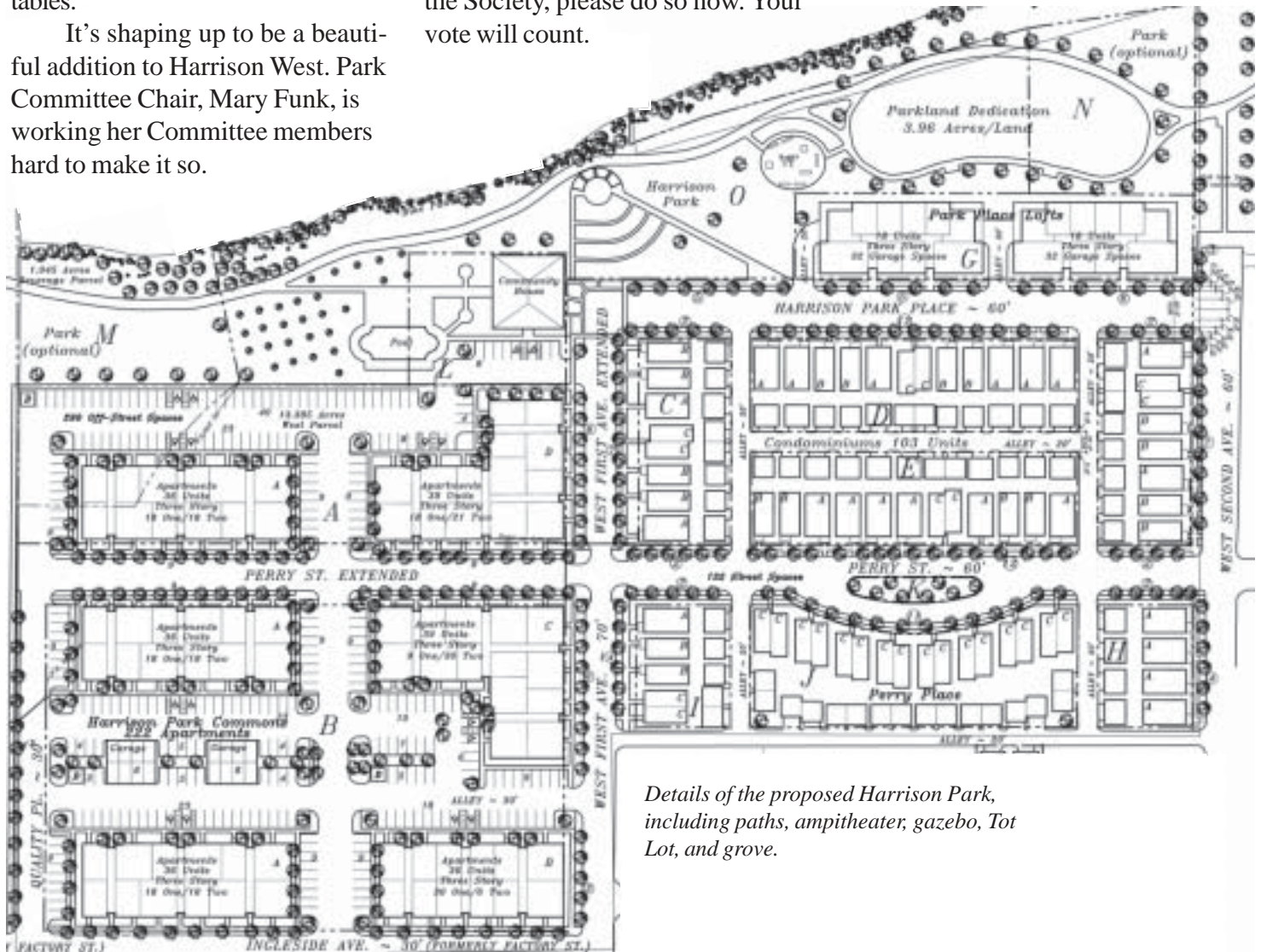
Details of the proposed Harrison Park, including paths, amphitheater, gazebo, Tot Lot, and grove.

Months ago, the Seniors at the Center on 4th Avenue were moved out so their building could be renovated. Nothing has happened to the building, but the Seniors have been consigned to Sawyer Tower. At the last P&D meeting, the Society decided to ask for assurance from CPOM that Harrison West will get its Seniors back when their building is finished.