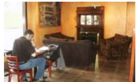
Comfy seating and a flickering fire make the cozy corner a favorite on cold nights.

butter in the middle, and premium chocolate on the top.