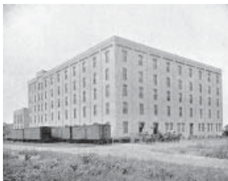
Taken from, "Twentieth Century Official Illustrated History of The Columbus Trades and Labor Assembly and its Affiliated Organizations. The Columbus Trades and Labor Assembly of Columbus, Ohio, 1901. The Berlin Printing Co, Columbus Ohio.

The plant is one of the most substantial of any built for manufacturing use in Ohio. The specialty of the Capital City Dairy Company is high grade "Purity" Butterine.