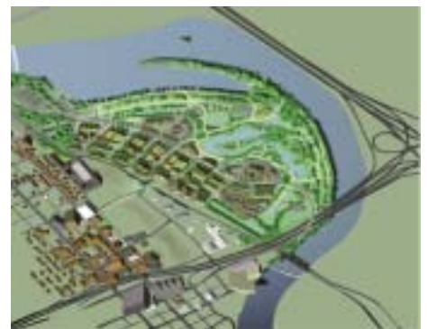
Artist's rendering of the Whittier Peninsula with parkland, wetlands, and development.

The Whittier Park Advisory Committee presented its Master Plan for the park last week. The 80-acre Whittier Peninsula Park will include a 12-acre wetland; a multimillion-dollar nature center funded and run by Audubon; wildlife observation area; public art; a play area; meadows, open fields, lawns, picnic areas and outdoor classrooms.