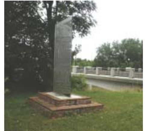
One of the Side by Side sculptures BrickStreet Arts Association helped bring to Harrison West. BrickStreet Arts is a valuable group that deserves your support. Next time you shop at Wild Oats, take your own bag and donate your Wooden Nickle to BrickStreet Arts.

Current BrickStreet Art projects are public art for one of the pocket parks in the Short North, a mural in the Short North, a piece of art for Goodale Park, and art for the new Harrison West Park.