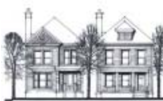
Architect's rendering of planned single family houses to be built on Perry Street. (Drawing courtesy Architectural Alliance)

September 1 is projected as the start date for construction on houses in this newest part of Harrison West. Building will start on Perry Street.