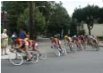
All the excitement at the Wendy's Bike Race every July.