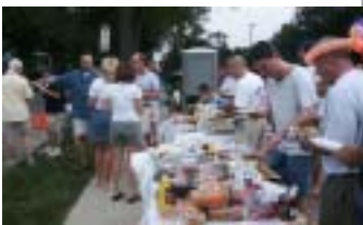
All the eating and talking at the Summer Party every July.