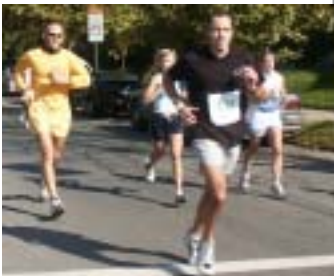
Lots of fun and exercise at the Marathon Party every October.