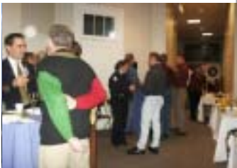
All the eating and talking at the Holiday Potluck every December.