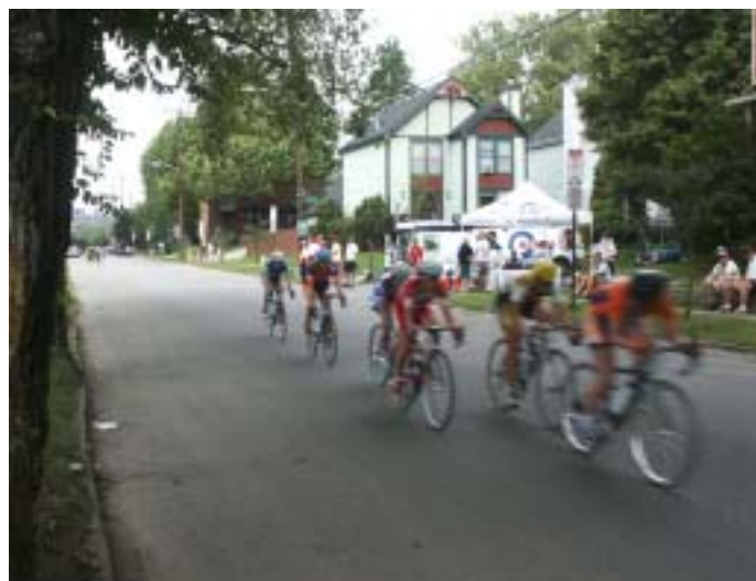
Everything was SPEED during the Harrison West Bike Race (above) and fun and flavor at the Harrison West Summer Party (left). If you missed either, you missed a fun event.