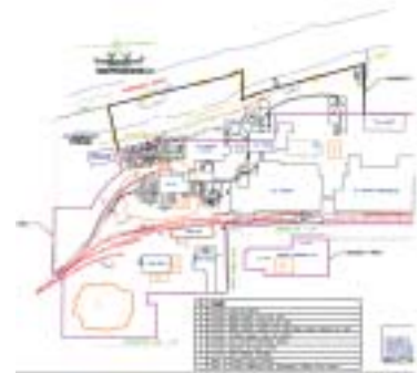
Go to the Humko section of harrisonwest.org to see a scalable map of the site, including the contaminated areas.

During the remediation, methane gas will be burned off in flares such as you see at landfills. Also, beginning immediately, trucks will be bringing clean fill dirt to replace the contaminated soil which will be removed.