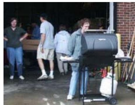
Feeding the hungry, wet, and hot weeders after the event took lots of hot dogs.