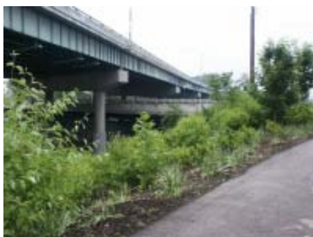
(left) The weeded and cleaned up bike path is attractive even in the rain.