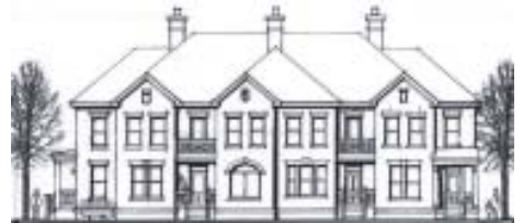
The condominiums might look like these, still in the style and scale of Harrison West houses.