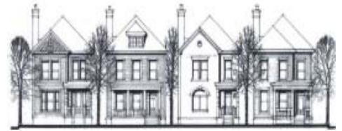
Single-family houses such as these should line First, Second, Perry, and Percy. Duplexes and Triplexes will be mixed in, just as in the neighborhood now.

The P&D Committee believes that this Wagenbrenner Realty project, especially the inclusion of the neighborhood from the beginning, will stand as a model for future ventures of this kind.