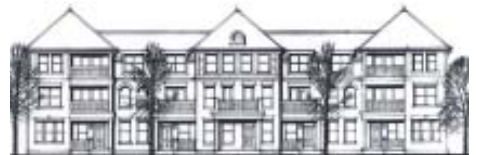
Apartments would be similar to Victorian Gate in the Short North, with the parking mostly hidden behind and between the buildings.