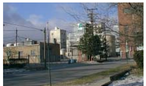
The Humko site today is a blight on the neighborhood.