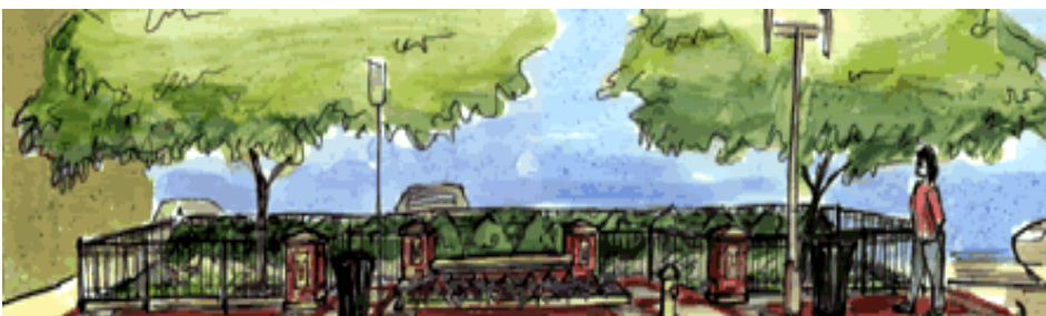
The Short North Pocket Parks soon will be under construction, according to Tim Wagner, Short North Improvement District head. Millay Park at the corner of High Street and Millay Alley next door to Functional Furnishing will be the first park to be built. Pavement Art for that Pocket Park has already been selected. Next up is art for Greenwood Park, 1 block south of Fifth on the west side of the street.