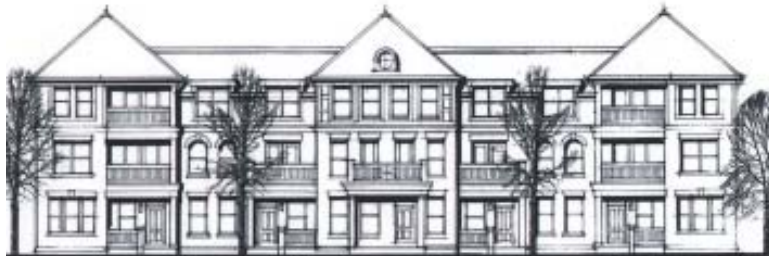
Apartments would be similar to Victorian Gate in the Short North, with the parking hidden behind the buildings.