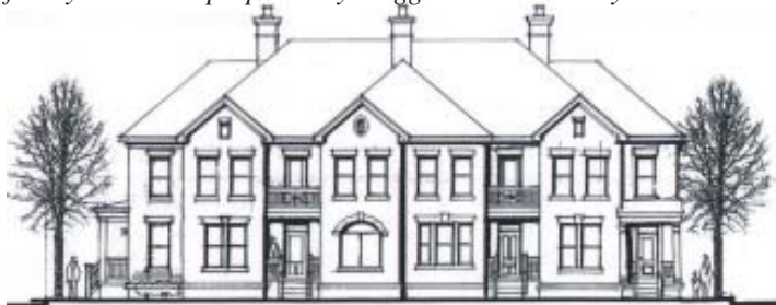
The condominiums might look like this, still in the style and scale of Harrison West houses.