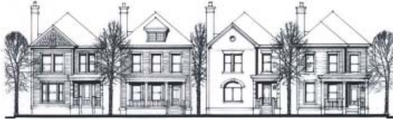
Look around the neighborhood for the prototypes of these single-family houses as proposed by Waggenbrenner Realty.