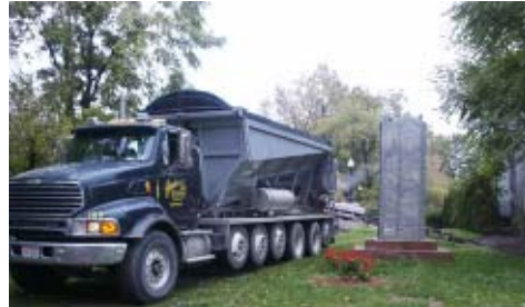
It was a tight fit, but the truck was able to maneuver around the Side by Side towers to fill all the beds and create mounding.

The Third Avenue Bridge Park got some much-needed landscaping help on October 19 and 26 when 32 cubic yards of topsoil for flowerbeds and mounding were delivered by Slinger Jones, Jones Topsoil's conveyor delivery system.