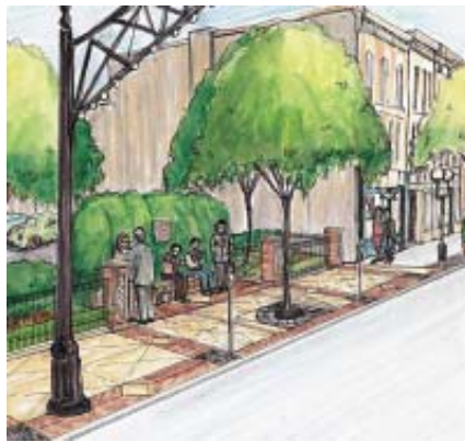
An artist's rendering of a proposed SNNF pocket park shows trees, bushes, and a bench along an upgraded sidewalk on High Street.

A Pocket Park is a tiny green space that can be found in an unexpected place. The Short North Special Improvement District (SID) has identified at least 20 unexpected spaces on High Street in the Short North Art District. The